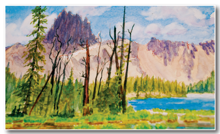
One of Susan Perin's collection that will be available in cards soon.

controversial, significant work has been done to minimize discomfort with the proposed wilderness bill for Central Idaho. The Sawtooth Society supports the bill in its current form.