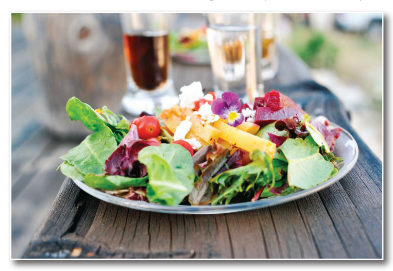
Do not miss the gourmet food and reconnecting with old friends at this year's Soiree!

All we are missing is you! Please help us make the 2010 Sagebrush Soiree <u>the</u> <u>best ever</u> and call 208.721.2909 to purchase your tickets today.