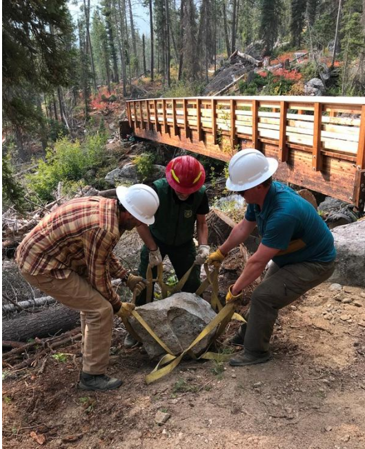
Volunteers working on Grand Mogul Bridge.