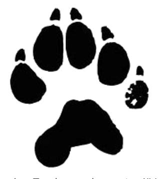
Wolverine Tracks can be up to 4" Long

Winter is a great time to view wildlife in central Idaho; just remember to keep their best interests in mind!