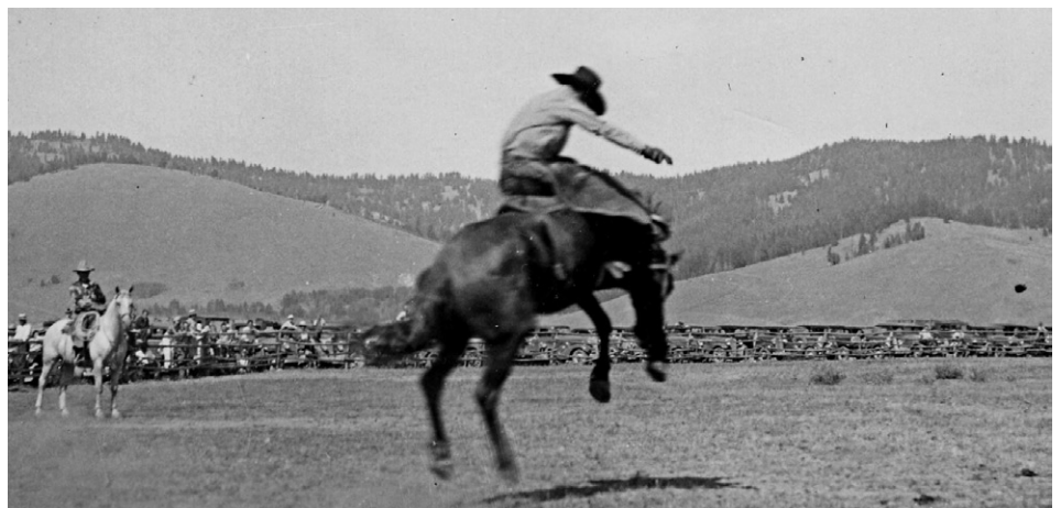
You too can have a thrill, come to the Sagebrush Soiree on July 30!

As space is limited, please don't wait to buy your ticket; you do not want to miss this event! Call the Sawtooth Society at 208.721.2909 and encourage your friends and neighbors to do the same. If you cannot make it to the festivities this year, but would like to receive the final gift list to place an absentee bid or make a donation, please let us know.