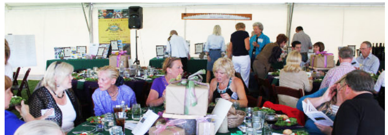
The 2012 Soiree was quite the party!

Apart from being the primary fundraiser for the Sawtooth Society, this tremendously fun evening, with an elegant dinner and incredible views, is an opportunity to make new friends, reacquaint with former colleagues and neighbors, and the perfect place to invite others to learn about the Society's efforts in protecting, preserving and enhancing the Sawtooth NRA. If you would like to discuss donating an auction item please contact the Society at 208.721.2909.