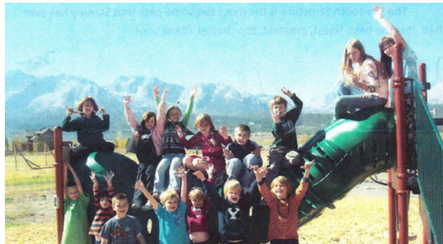
Stanley school kids celebrate their new playground funded in part by a grant from the Sawtooth Society.

If you already have a Goat Plate, we appreciate your contribution to this fund. Please buy another! If you don't have one what are you waiting for? They are the best looking license plates on the road! If you know about projects that might enhance the recreation in the Sawtooth NRA, please contact the Society.