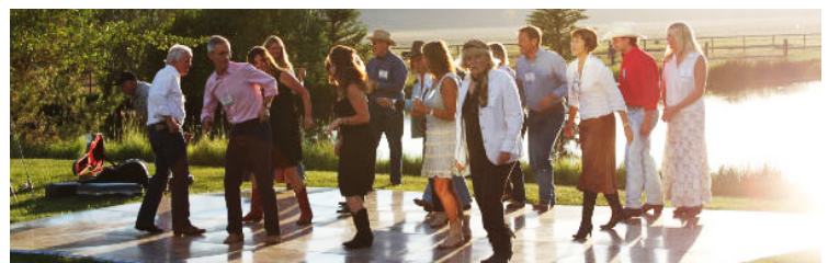
Don't miss the fun in 2013!