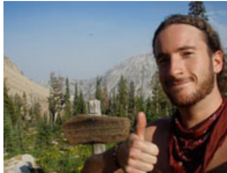
Join with us to preserve Austin Kraal's legacy of passion for the Sawtooth NRA.

within the Sawtooth NRA are not being accomplished. The U.S. Forest Service has now completed an assessment of priority projects on which they need assistance. These projects range from river, lake and highway clean-ups, restoration of iconic fencing to protect fragile areas, elimination of non-wildlife friendly fencing, trail clean-up and