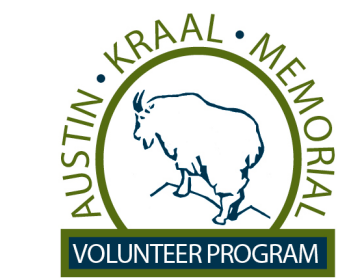
Sponsored by the Sawtooth Society