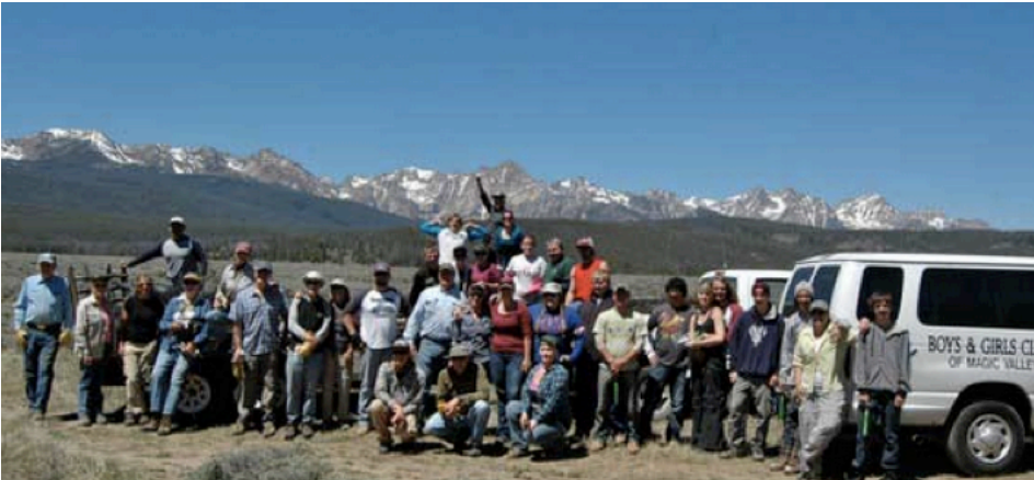
Boys and Girls Club of Magic Valley volunteers and Sawtooth Society members celebrate the completion of two projects.

Another way to help out is to provide information about trail problems and concerns so we can share that information with the Forest Service and use it to help prioritize the scheduling of trail maintenance. So as you hike throughout the Sawtooth NRA we would encourage you to report these trail conditions by completing the enclosed form and either scan it to gary@sawtoothsociety.org or mail to The Sawtooth Society at PO Box 209, Stanley ID 83278. You may also complete it online at our website www.sawtoothsociety.org .