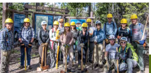
Crew Leader College – Field proficiency day for the next generation of trail crews