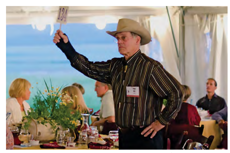
Don't miss your chance to secure one of the wonderful auction items!