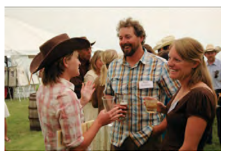
Gather up your friends and come to the Sagebrush Soiree on July 29

Attendees will indeed experience a fun and high energy event, and will also enjoy an elegant gourmet dinner, along with incredible views of the Salmon River, the Sawtooth and White Cloud Mountains. Plus, it is an opportunity to make new friends and reacquaint with former colleagues and neighbors. Invite