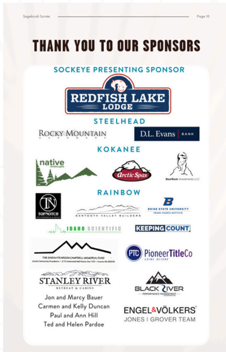
SAGEBRUSH SOIREE 2024 PROGRAM