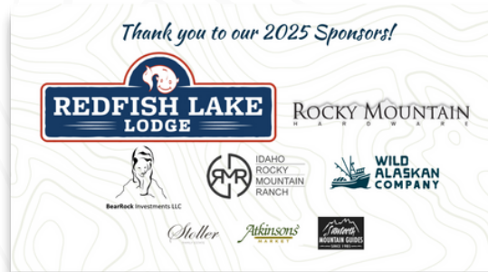
SAGEBRUSH SOIREE 2025 AUCTION SLIDES